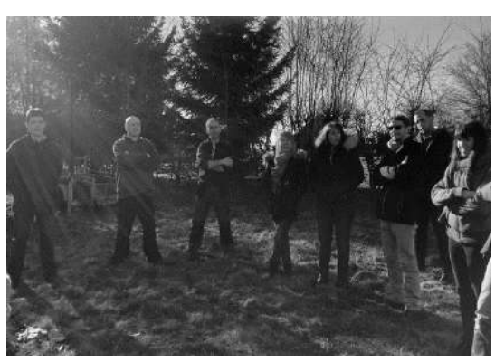
Training week: work sessions (left) and field visits (right), in Tubize (top) and Bastogne (bottom)...