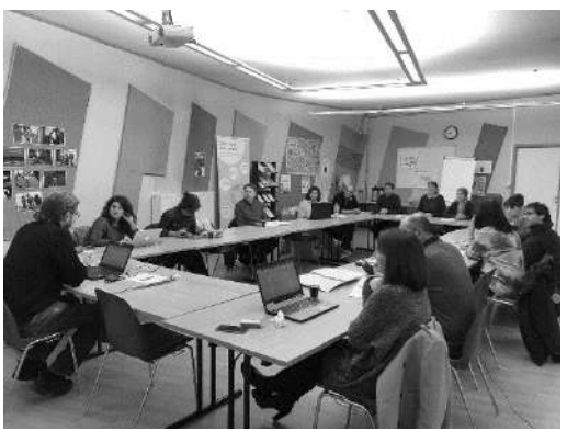
Namur: participants' meeting (above, left), exchanges with the Committee (right); steering (below, left).