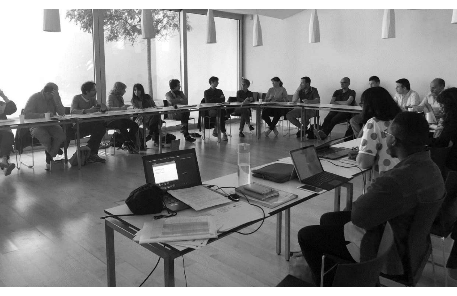
Transnational meeting in Porto, June 2019, the steering Committee and the trainers launch the joint working session...