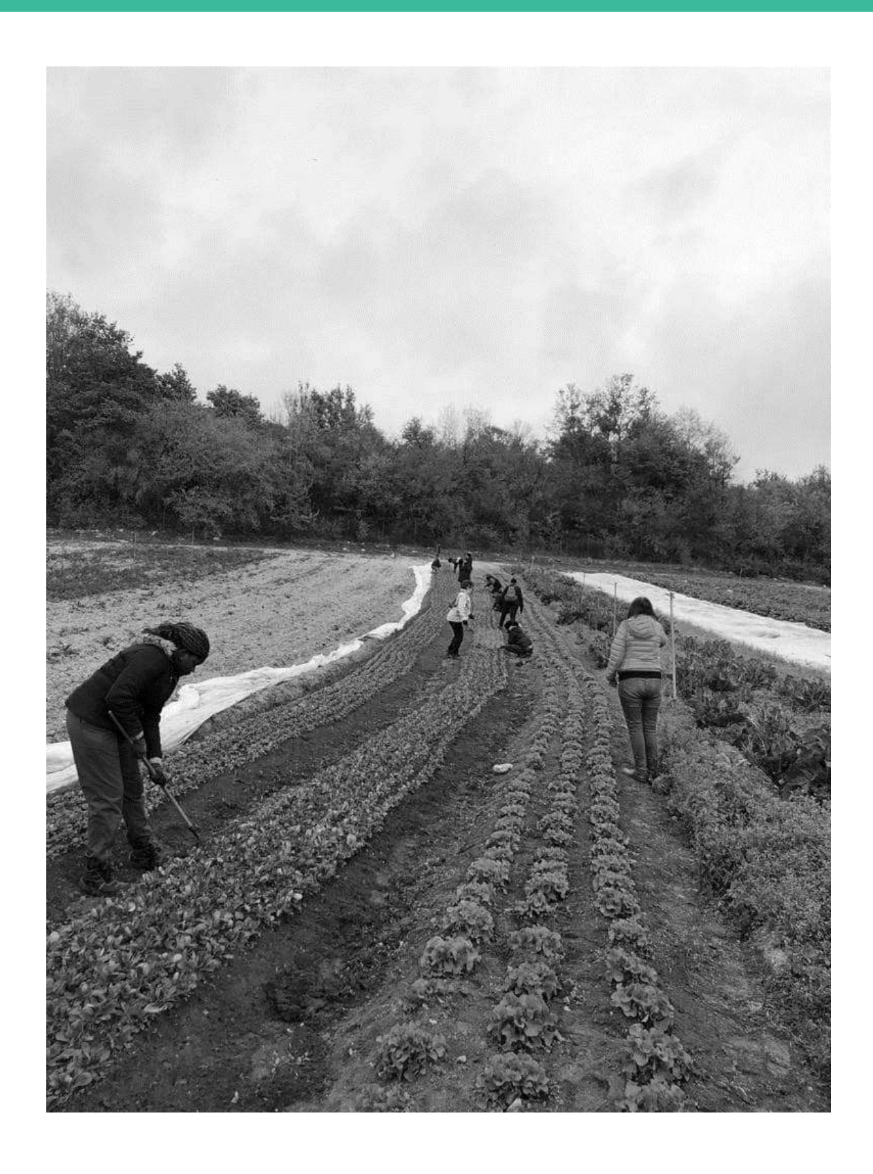
Transnational meeting in Cergy, October 2018, visit to work-based training sites, following established good habits.