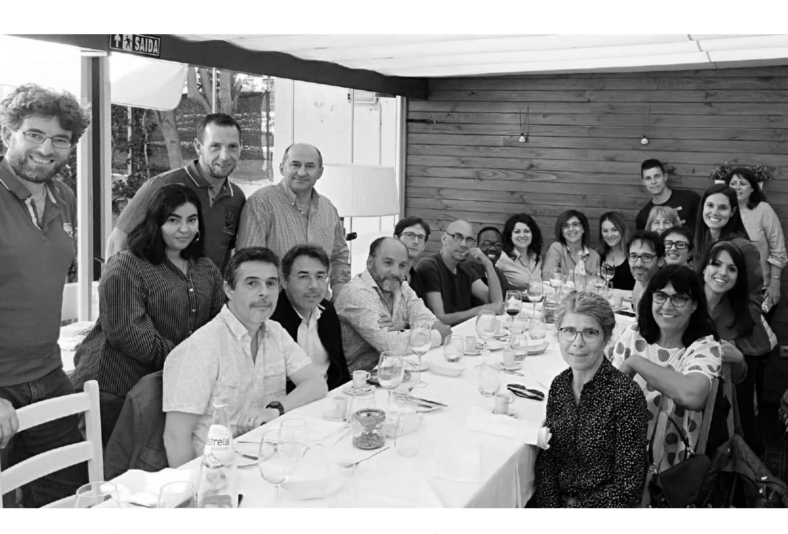
Transnational meeting in Porto, June 2019, the group of partners and trainees in all its diversity...