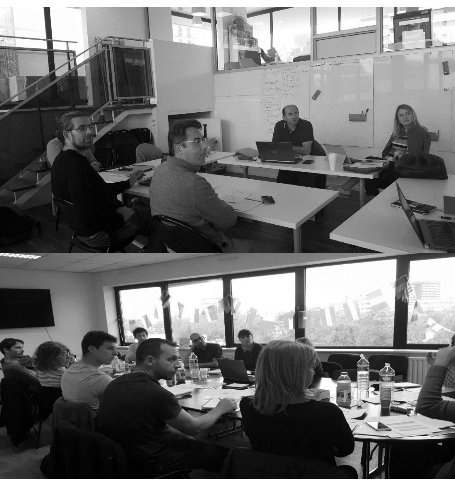
Transnational meeting in Cergy, October 2018, the committee ensures the project is properly (above). While, at the same time, the trainers debate in working groups (below).