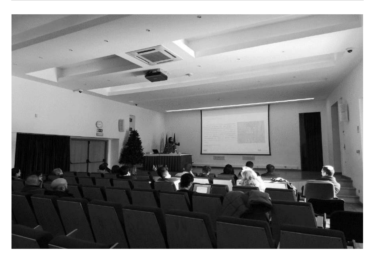
National workshops: presenting the initiative, Portuguese style...